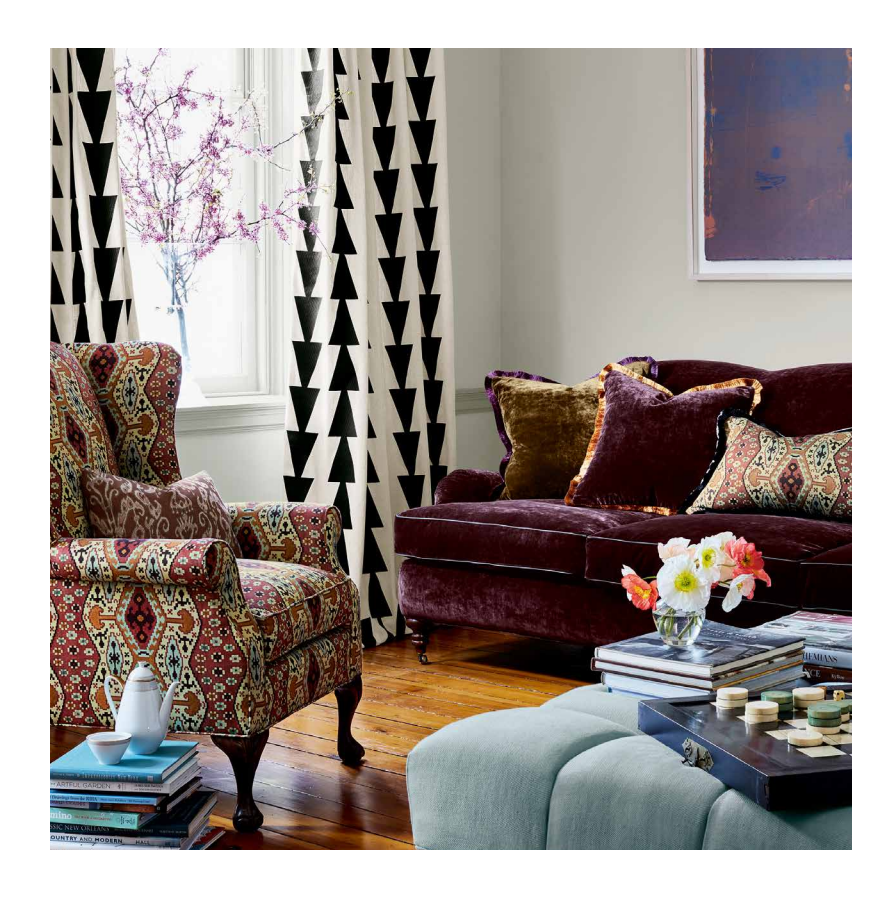
Bohemian | Collection 2018

English interiors have always included an inspired mix of the traditional and the exotic. Since the days of the Empire when treasures from the Far East and Africa mixed with floral prints and fine velvets, the English home created a romantic blend of the familiar with the unexpected. It's this spirit of world travel and artistic expression that defines the new Hodsoll McKenzie Bohemian collection.