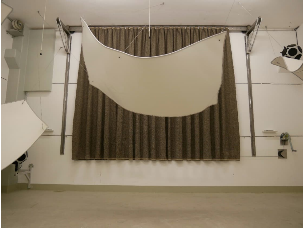
Figure B.1. Test object mounted in the reverberation room, frontal view.