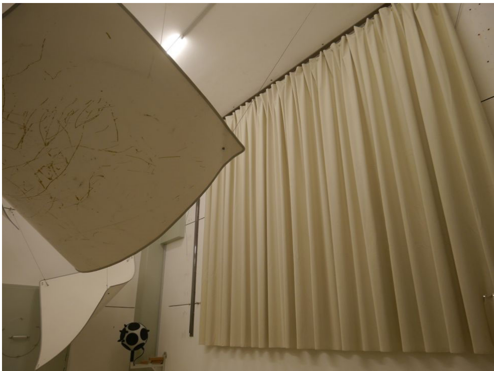
Figure B.2. Test object mounted in the reverberation room, diagonal view.

\\s-muc-fs01\allefirmen\MI\Proj\146\M146189\M146189_10_PBE_1E.DOCX : 10. 05. 2021