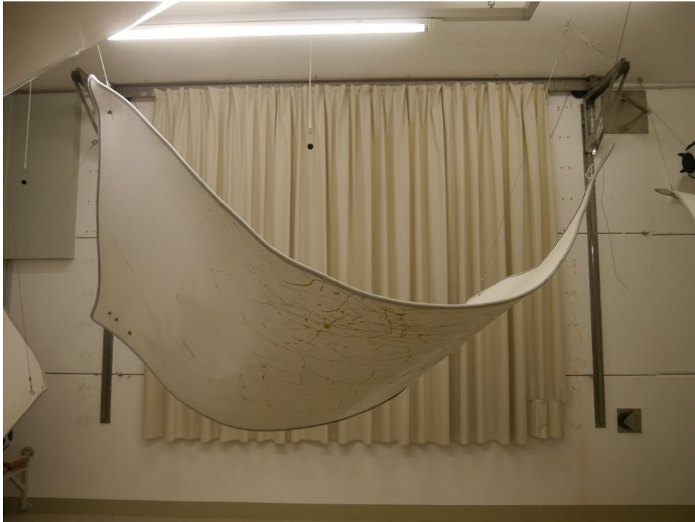
Figure B.1. Test object mounted in the reverberation room, frontal view.