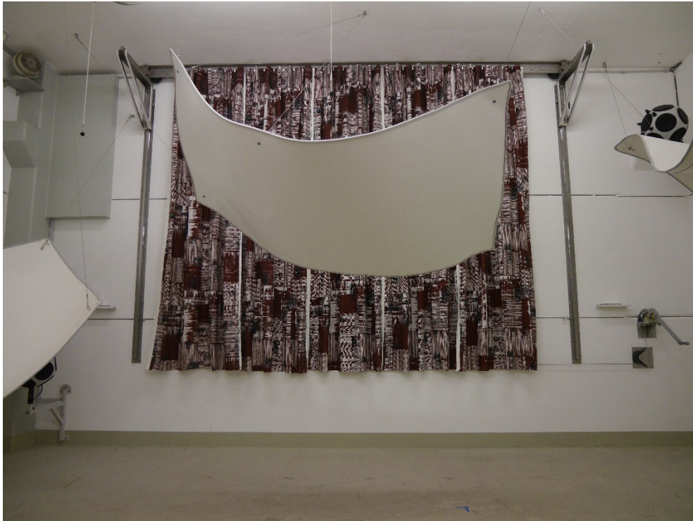
Figure B.1. Test object mounted in the reverberation room, frontal view.