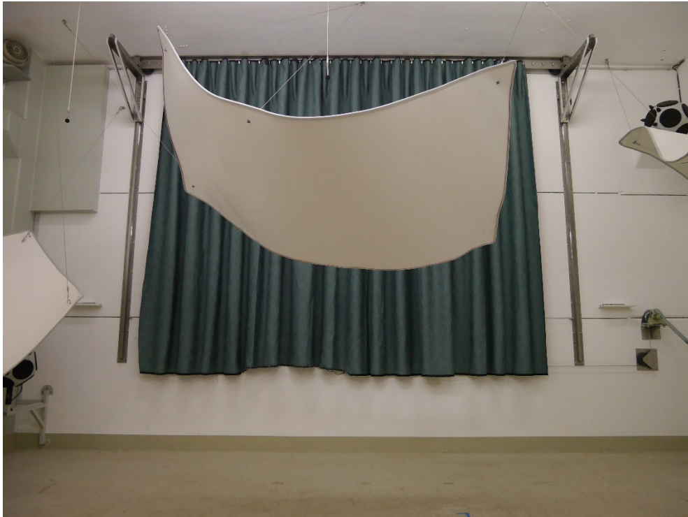
Figure B.1. Test object mounted in the reverberation room, frontal view.