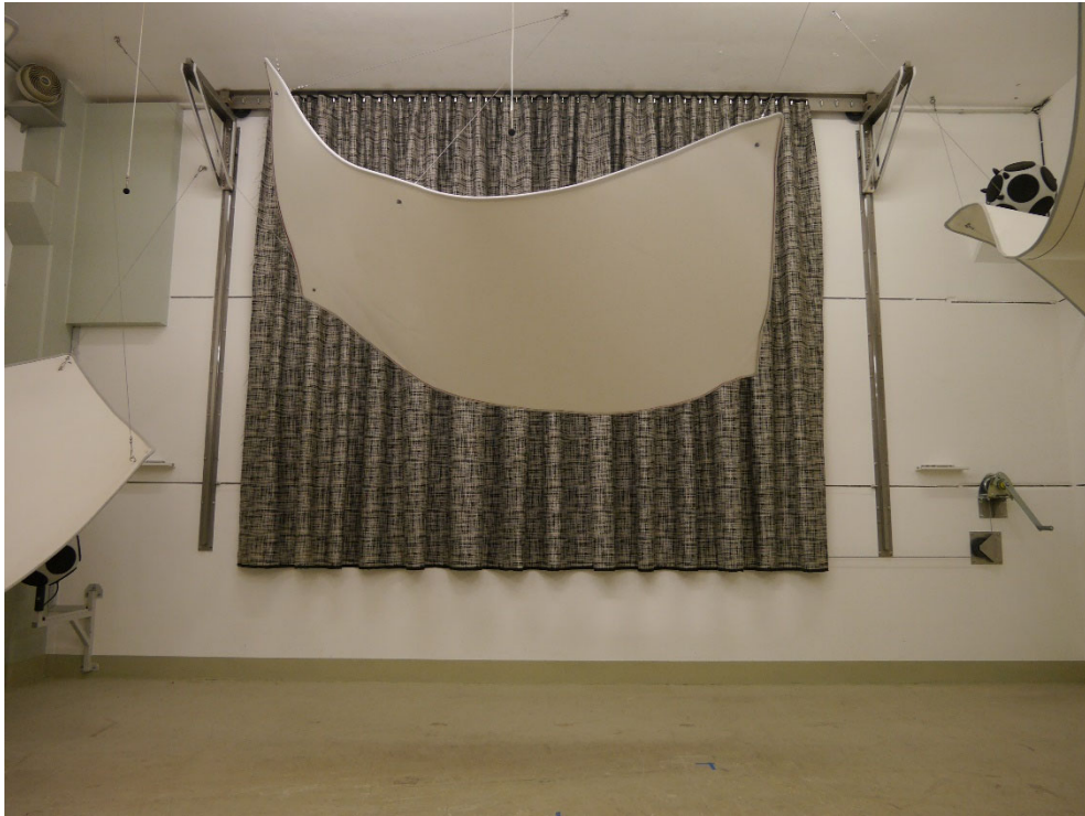
Figure B.1. Test object mounted in the reverberation room, frontal view.