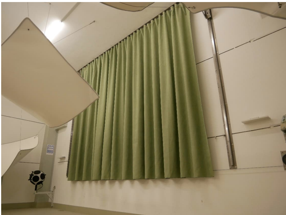
Figure B.2. Test object mounted in the reverberation room, diagonal view.

\\s-muc-fs01\allefirmen\B\Proj\137\B137948\B137948_11_Pbe_1E.DOCX:11.05.2023