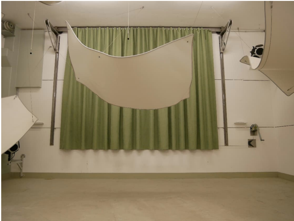
Figure B.1. Test object mounted in the reverberation room, frontal view.