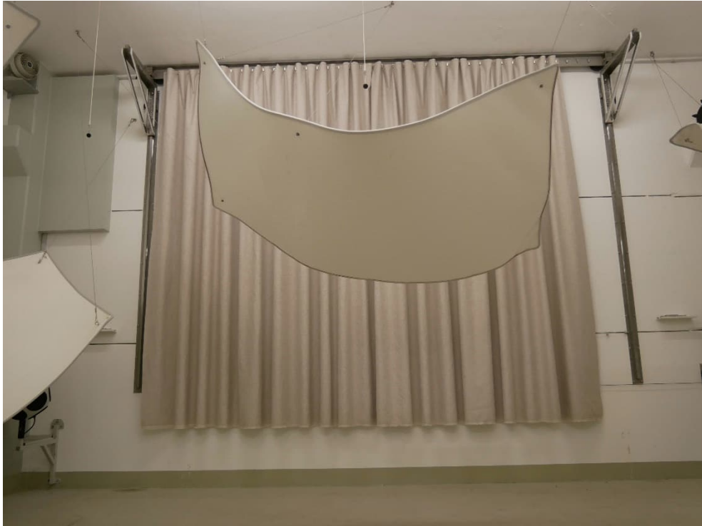
Figure B.1. Test object mounted in the reverberation room, frontal view.